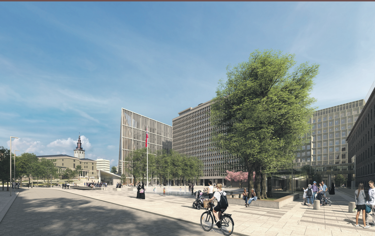
Illustration: Statsbygg/team Urbis

The preliminary project (based on the winning proposal) shall be developed with a detailed budget and must be realisable within the NOK 50 million framework.