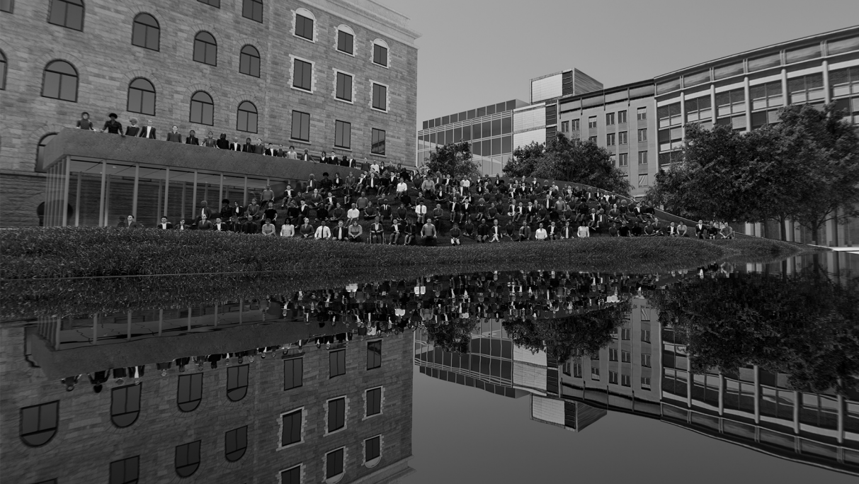
Illustration demonstrating the space above the Fold designated for ceremonies and events.

Fold is not just a space for reflection - it is also a stage for rituals and meaningful traditions. Each year, on the solemn anniversary of July 22, the memorial will become a sanctuary of remembrance, honouring the lives lost and the resilience of those who survived.