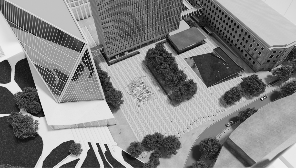
Illustration of the Fold in the new government quarter. Visualisation: Jad Nassour. ©Røstad + Khoury